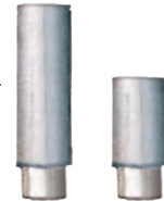
#FJ7880BK adapter extension kit

Includes four 3 1/2" (89mm) and four 5" (127mm) adapter extensions, mounting rack and hardware.